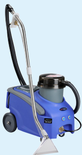
The Britex machine & carpet wand.