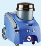
The Britex machine